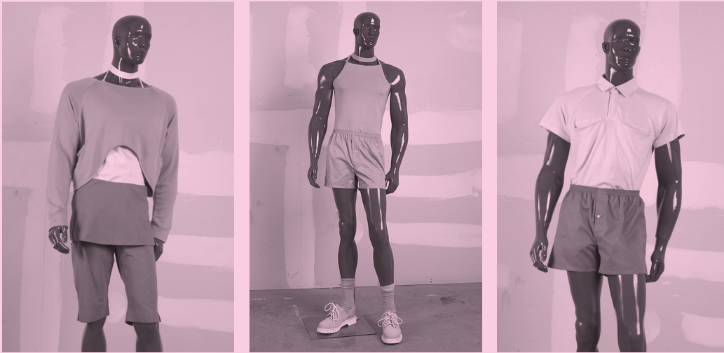
Three hot Telfar looks as modelled by a well-defined red mannequin. Left to right: rib-cage sweater, backless halter top and apron shorts; square-neck tank with choker attachment and boxer shorts with back pocket; cap-sleeve polo and boxer shorts.

Machofucker and Coco Dorm are my top three studios. They make really good porn. Do you have a 'type'?