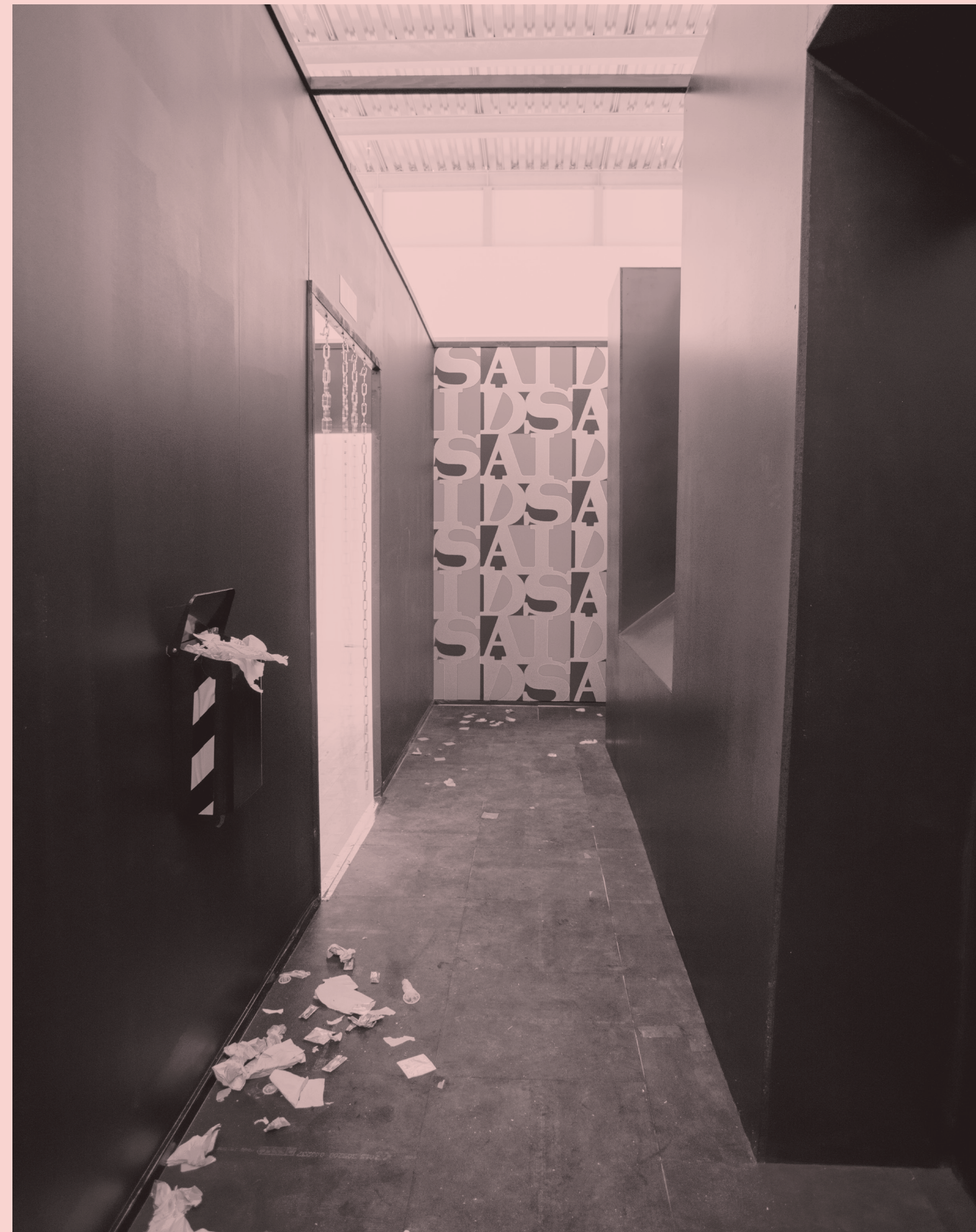
Installation view of AIDS (Wallpaper) (1989) by Canadian collective General Idea: "Made at a time when mainstream media could barely utter the word"

In its second incarnation, in February 2019, the Cruising Pavilion