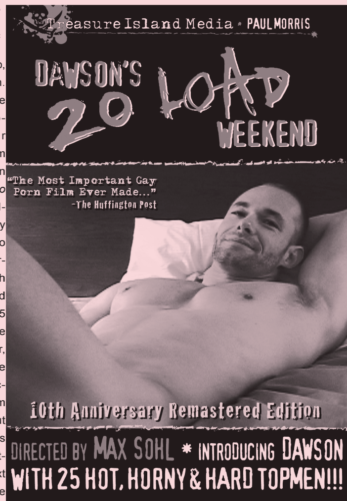
DVD cover of the 2004 bareback porno Dawson's 20-Load Weekend : "Shift in sexual psychology as a result of pharmaceutical breakthroughs"

largest financial investments in the history of gay architectural space.