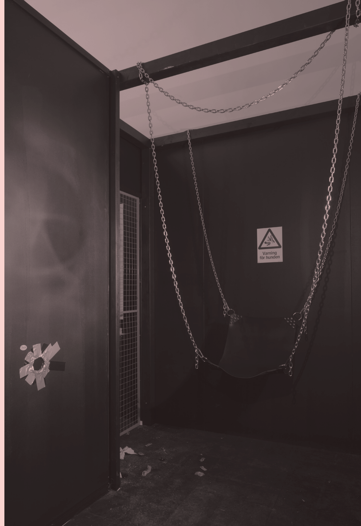
Based on his own DIY instructions architect Andreas Angelidakis installed a 6 by 7-meter Cruising Labyrinth during the 2018 edition of FIAC in Paris. A collaboration with Cruising Pavilion and Breeder gallery, Athens.

group. True to cruising's outlaw spirit of co-opting, Myrup, Mateos, Perrault, and Teyssou appropriated the naming structure of the biennial — each country showcases its brightest talents in a national pavilion (the Greek Pavilion, the Canadian Pavilion, etc.) —, declaring that in a biennial dedicated to free